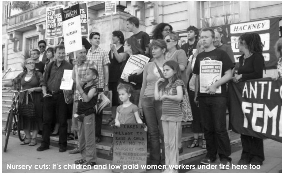
Nursery cuts: it's children and low paid women workers under fire here too

Under union pressure, the Learning Trust is now carrying out a pay review for support staff, likely to result in a pay rise of some sort, schools worried about the impact on their budgets of higher pay for women, plus the affect of back-pay,